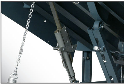
Unique hold-down assembly allows for full float and automatic release capability with air ride trailers.