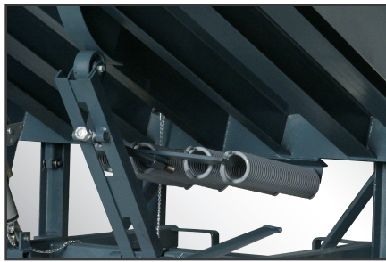
One point adjustable main spring assembly with roller and cam construction.